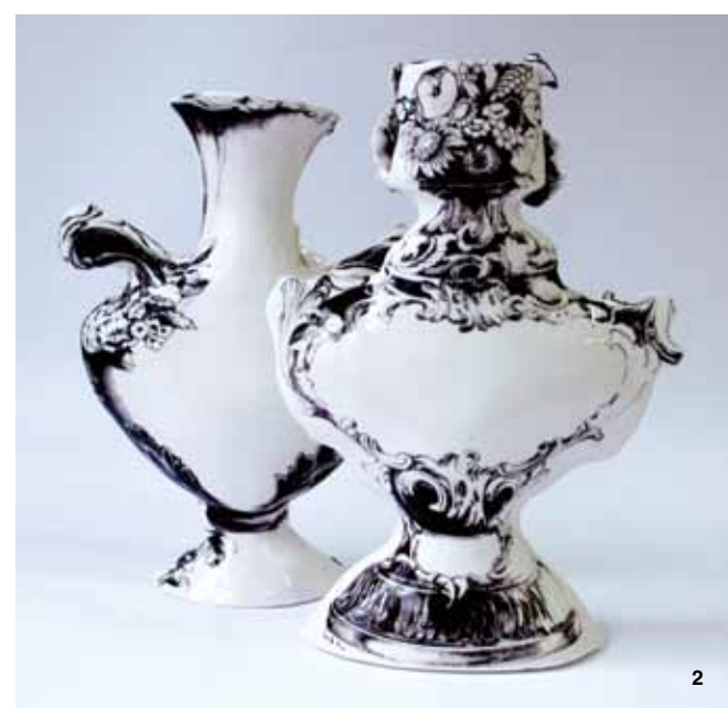
1 Edward Baldwin's interlude , 14 in. (35 cm) in diameter, Audrey Blackman porcelain, 2011. 2 Sun Ae Kim's vases, 10 in. (25 cm) in height, porcelain. 3 Phoebe Cummings' detail from residency studio installation at Victoria and Albert Museum, unfired clay, 2010. 1–3 on view at multiple locations as part of "British Ceramics Biennial 2011" (www.britishceramicsbiennial.com) in Stoke-on-Trent, England, through November 13. 4 Chiho Aono's A Soft Border , 23 in. (58 cm) in height, ceramic, 2008. "New Millennium Japanese Ceramics: Rejecting Labels and Embracing Clay," at Northern Clay Center (www.northernclaycenter.org), in Minneapolis, Minnesota, through November 6.